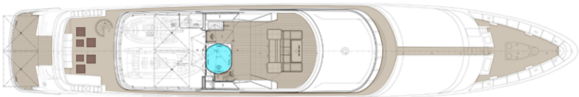
02 SUN DECK